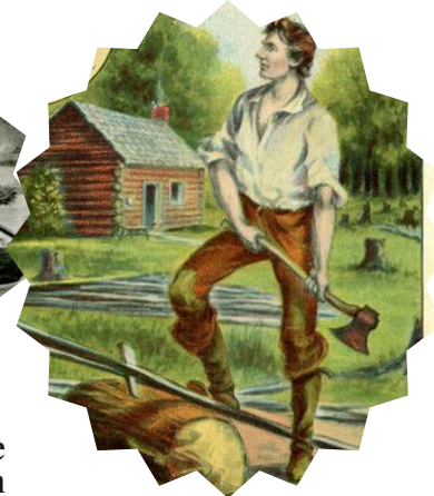
Lincoln wields his mighty axe