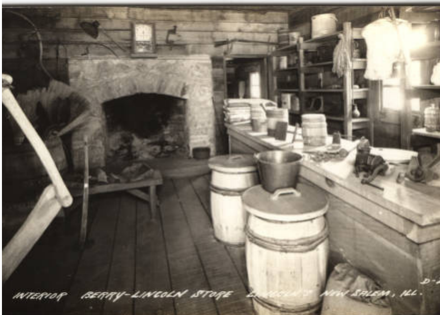
The Lincoln-Berry Store