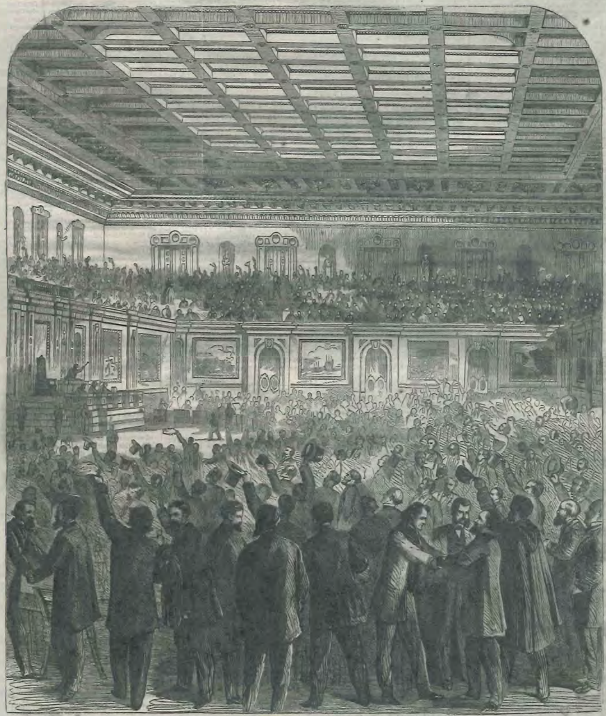
SCENE IN THE HOUSE ON THE PASSAGE OF THE PROPOSITION TO AMEND THE CONSTITUTION, JANUARY 31, 1865.

Entered according to Act of Congress, in the Year 1865, by Harper & Brothers, in the Clerk's Office of the District Court for the Southern District of New York.