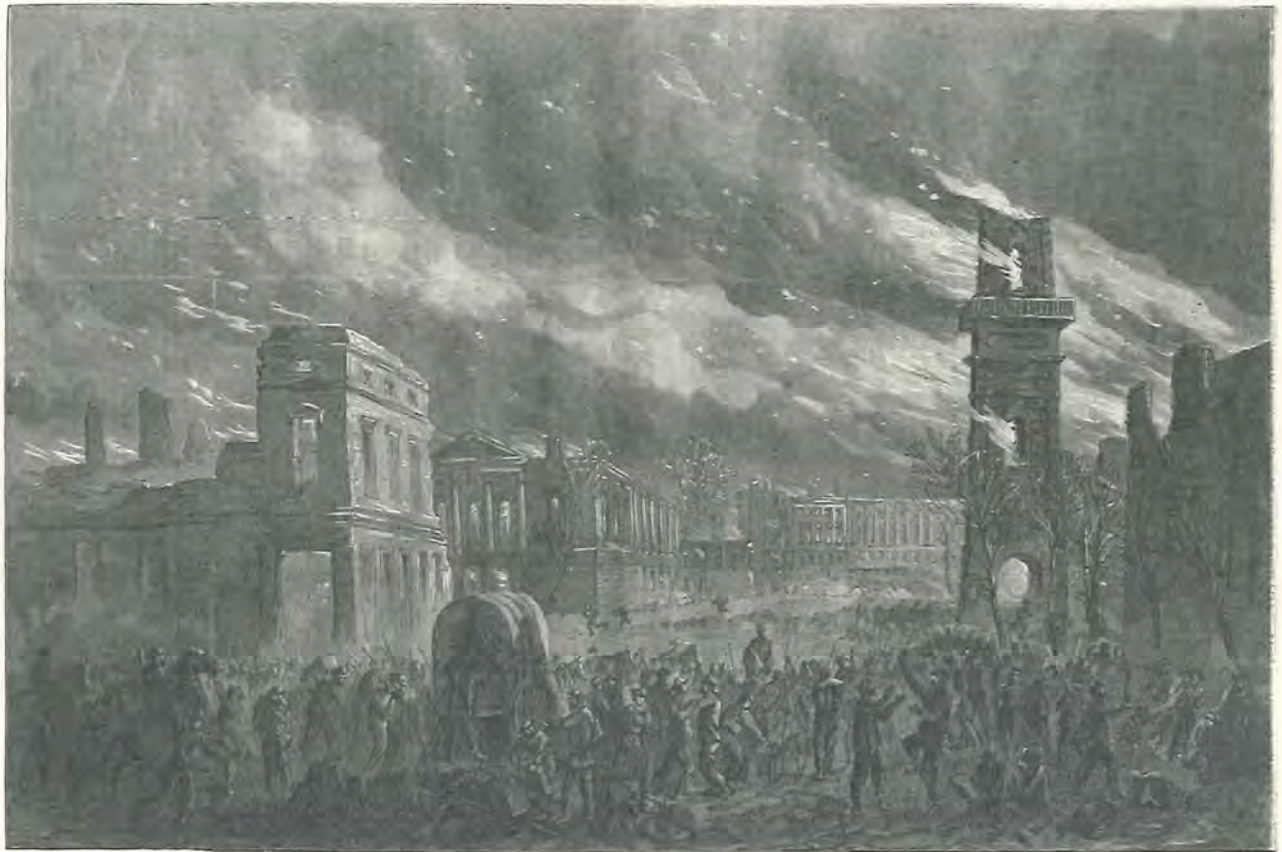
THE BURNING OF COLUMBIA, SOUTH CAROLINA, FEBRUARY 17, 1865.—[SKETCHED BY W. WARD.]

The Burning of Columbia, South Carolina, February 17, 1865. Sketched by W. Ward. Harper's Weekly, April 8, 1865