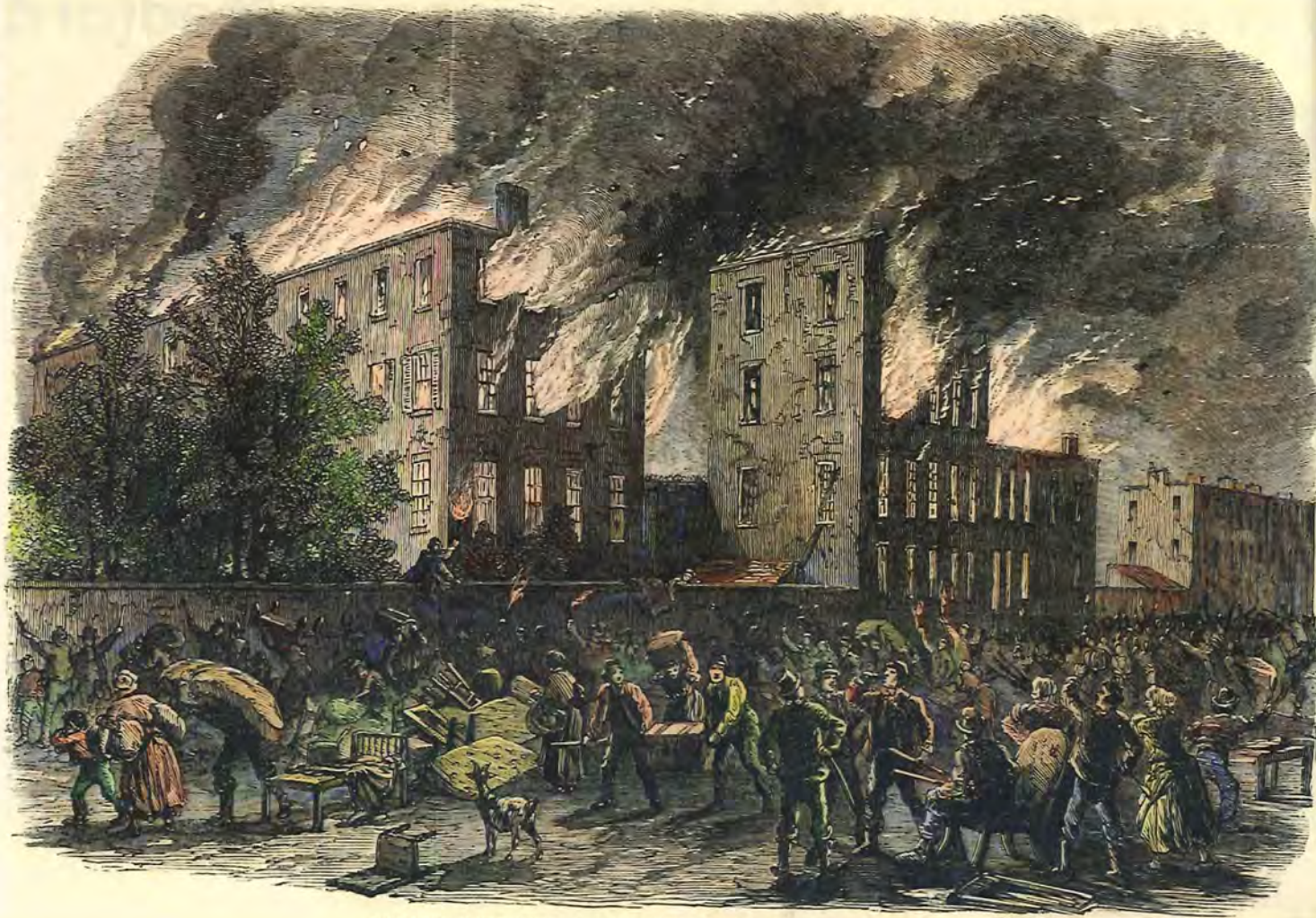
THE RIOTS IN NEW YORK: DESTRUCTION OF THE COLOURED ORPHAN ASYLUM.