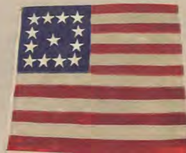
Patriotic Banner that hung in the Presidential Box at Ford's Theatre, April 14, 1865