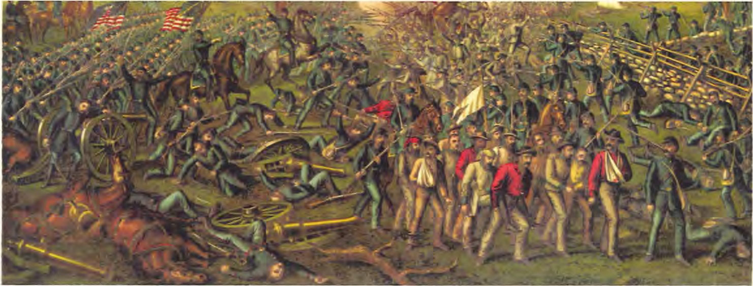
Battle of Gettysburg, Kurz & Allison, 1884