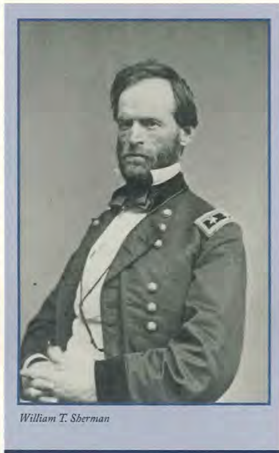
William T. Sherman

SG: Why did Lincoln decide to force the vote on the 13th Amendment with the House of Representatives which had refused to pass it in 1864? Did he consider the possibility of waiting for the newly elected Congress to be seated before addressing the issue?