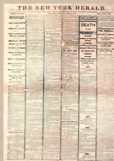
The New York Herald 10:00 o'clock edition, Saturday, April 15, 1865