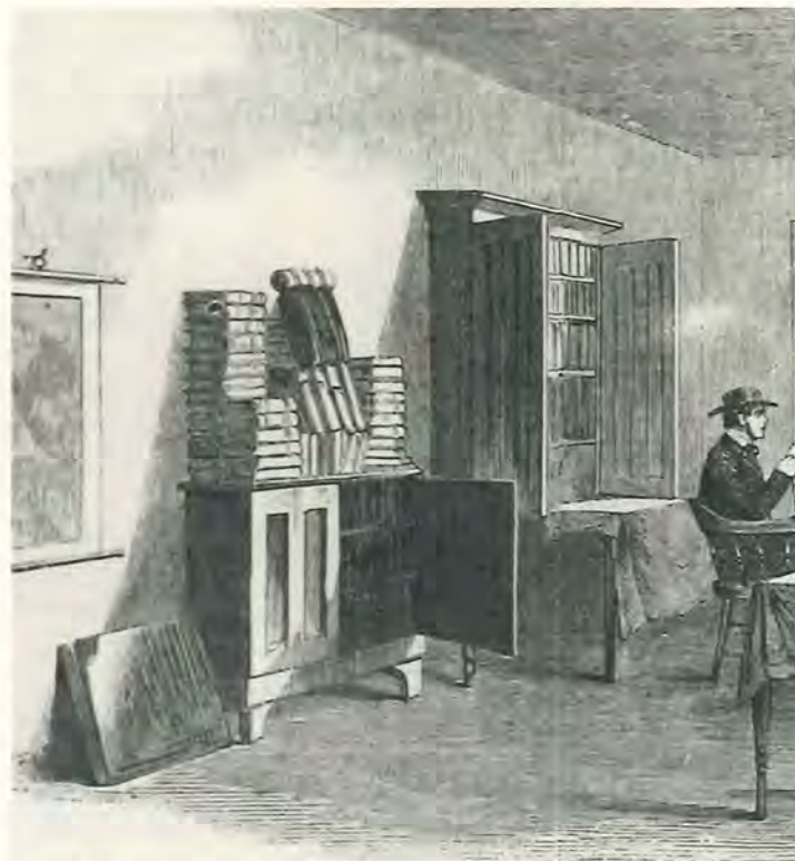
Lincoln-Herndon Law Office

Lincoln learned a significant amount from other attorneys, and his partnership with Stephen Logan was extremely rewarding; "[i]t is fair to say that no man contributed more toward bringing Lincoln's natural gifts as a lawyer to their fullest fruition." 10 Logan