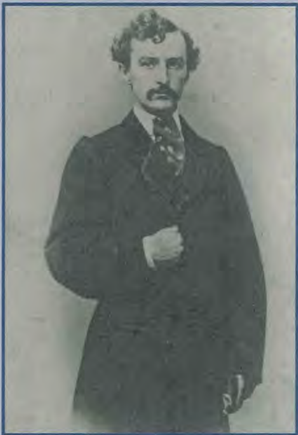
John Wilkes Booth