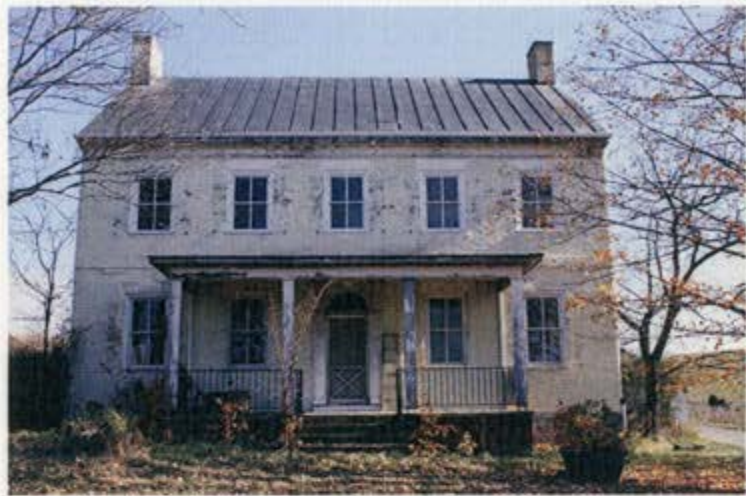
Lincoln Homestead front

Deeds and other documents reflect that Lincoln's great-grandparents moved from Pennsylvania to Virginia around 1768. 1 His great-grandfather, nicknamed "Virginia John" by Lincoln students to distinguish him from other family members with the same name, acquired 600 acres of fertile Shenandoah Valley land on Linville