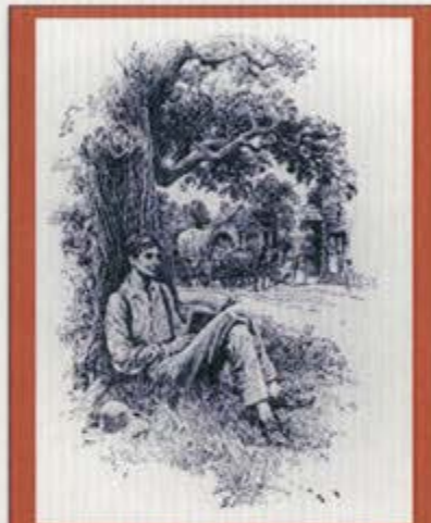
Lincoln studying under a tree in New Salem, #315