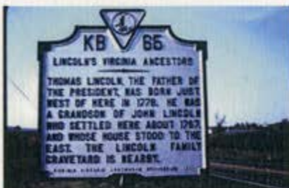
VA Roadmarker at the Homestead