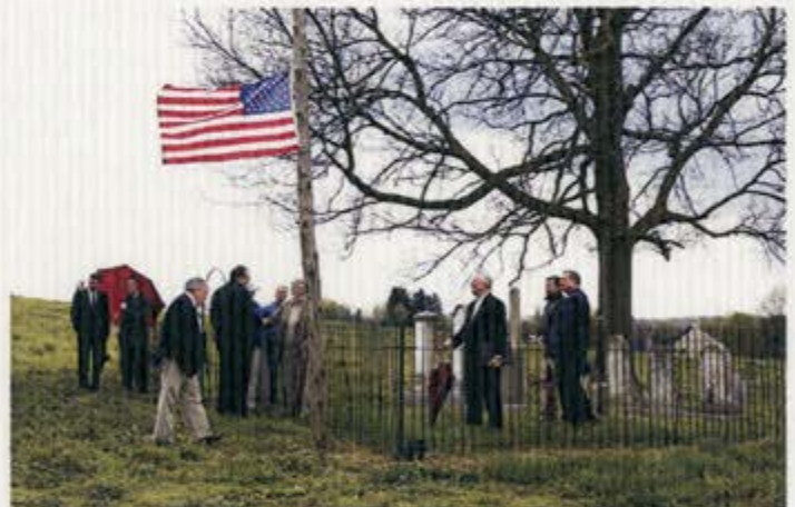
Crowd starting to gather for a special event