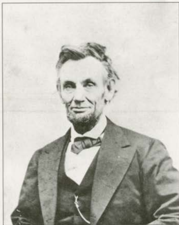
Lincoln in February 1865 (O-116).

James M. McPherson furthers the idea of the Civil War as a total war in "Lincoln and the Strategy of Unconditional Surrender." Unlike other historians who have emphasized the president's skill at military strategy, McPherson uses Carl von Clausewitz's analysis of war to show that military strategy was a part of his larger "national strategy." Lincoln always considered the southern states to be in rebellion, not members of a belligerent government; however, in practice, the North carried on the war much as if the South were a foreign enemy, as evidenced by its blockade of southern ports and its use of prisoner exchanges. As the war dragged on, the North changed to a national strategy that included total war and demanded unconditional surrender: "Lincoln lost faith in those illusory Southern Unionists and became convinced that the rebellion could only be put down by complete conquest." The Federal army would move to destroy the Confederate forces, and enemy property was confiscated. Most important, Lincoln moved toward emancipation as a military measure to weaken the enemy and gave the war a revolutionary character. In the end, peace would require both the restoration of the Union and the abolition of slavery (pp. 40-43, 45-47, 52-60).