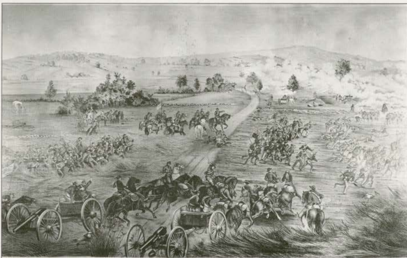
BATTLE OF GETTYSBURG, JULY 1-3, 1863

to relay to his audience his conviction that the nation should fulfill the purposes for which the nation was founded, as expressed in the Declaration of Independence. . . For example, Lincoln used a "romantic nature-imagery of birth and rebirth" to resolve that the nation "shall have a new birth of freedom," and that its popular government "shall not perish from the earth." More important to Wills's purpose is to reveal Lincoln's perception of the founders' role