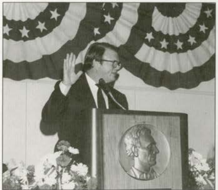
Professor Garry Wills delivers the principal address at this year's Springfield banquet.