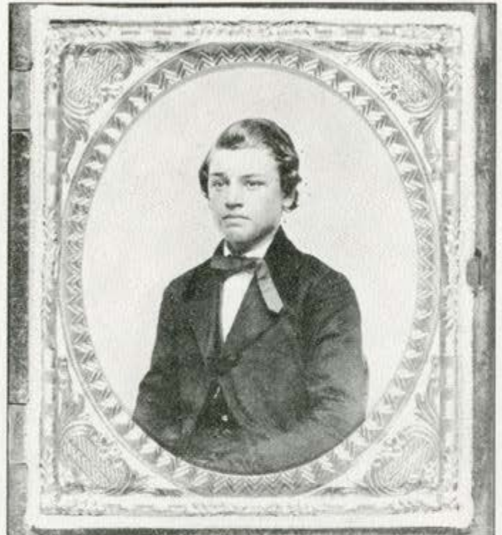
Ambrotype of Robert Todd Lincoln — as he looked when his father was engaged in his famous debates with Stephen A. Douglas.

The Lincolns, accompanied by a host of relatives and friends, arrived in the national capital, in February 1861, for the Sixteenth President's inauguration on the following March 4. Photographers were quick to make carte-de-viste (visiting card-size) photographs of Lincoln and his family. But it was not until 1985 when the last of the direct line of