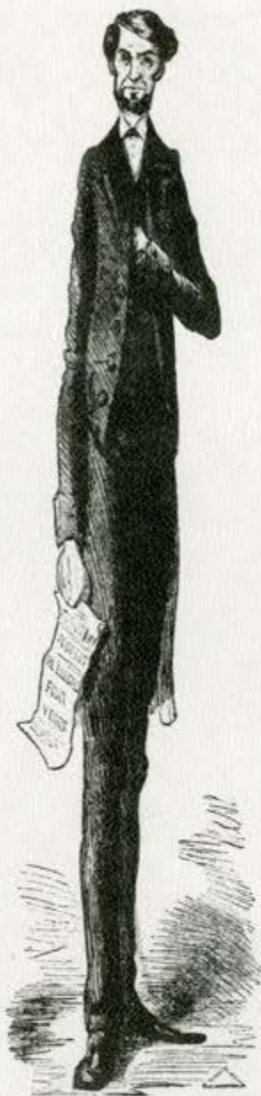
Lincoln's unusual height seemed comical in the nineteenth century. It now seems to suggest physical dysfunction.

August, Le Monde again referred to Lincoln in the course of discussing the genuinely useful medical research that has recently isolated the gene for Marfan's Syndrome.