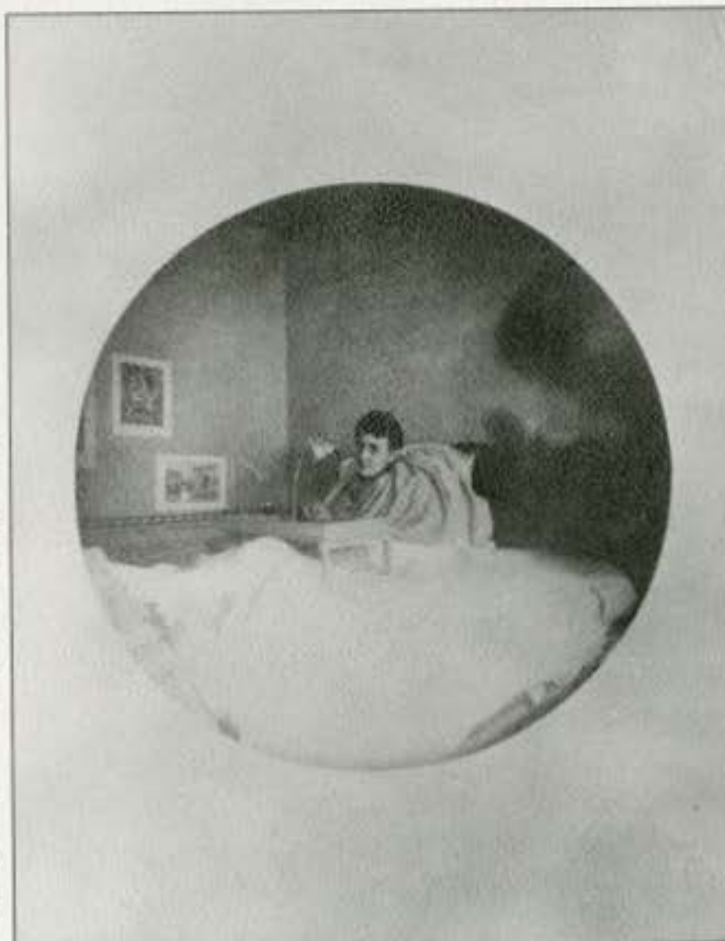
Abraham Lincoln II ("Jack") on his deathbed in Europe. This is the earliest form of snapshot photograph with characteristic bullseye format.

This is no mere presentation of photographic images accompanied by meager text.