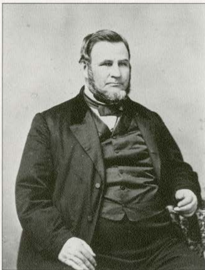
From the Lincoln Museum