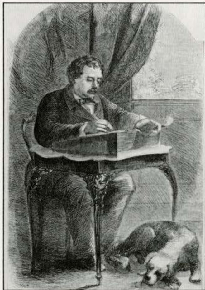
From the Louis A. Warren Lincoln Library and Museum

Four years in the Army of the Potomac. A soldier's recollections. London, 1881