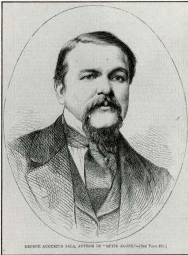
From the Louis A. Warren Lincoln Library and Museum