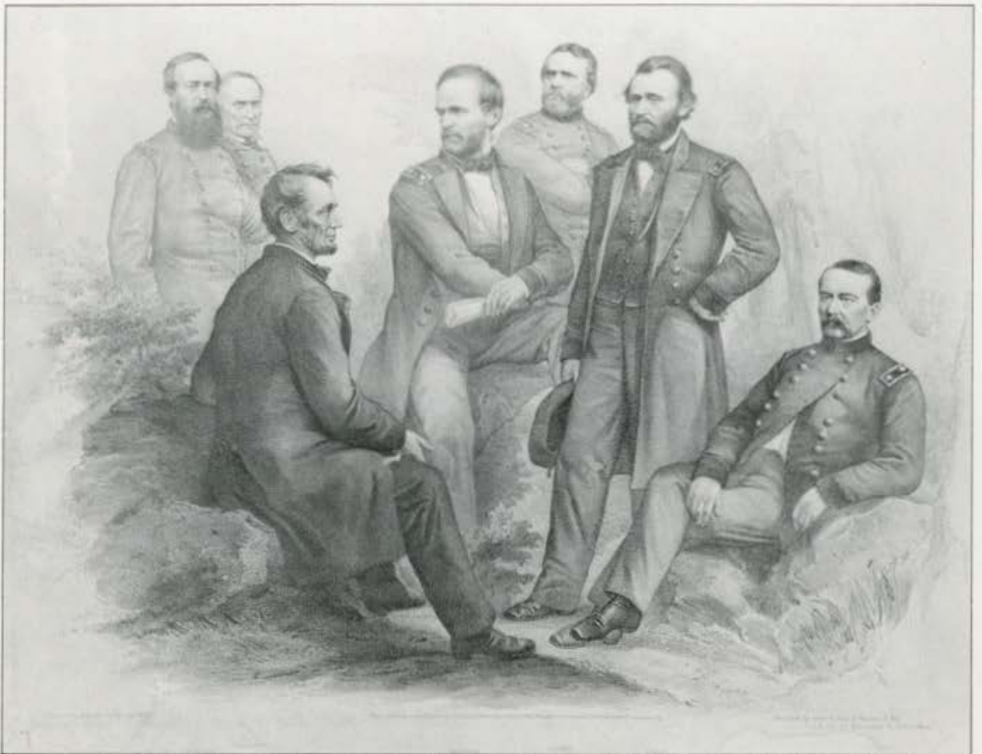
Those who attend LINCOLN-175 will be able to view "The Lincoln Image: Abraham Lincoln and the Popular Print," an exhibit of engravings and lithographs at the Gettysburg College Art Gallery.