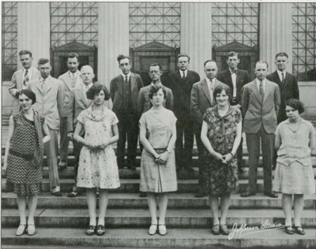
From the Louis A. Warren Lincoln Library and Museum

Somewhat against any better judgment I am releasing to you in this letter Lincoln data of which no person is advised except myself. Not that I feel that you will intentionally give publicity to the facts, but my experience in confiding in my friends to the extent of sharing with them the efforts of more than five years of intensive research has resulted rather disastrously. I now have in my library several small booklets