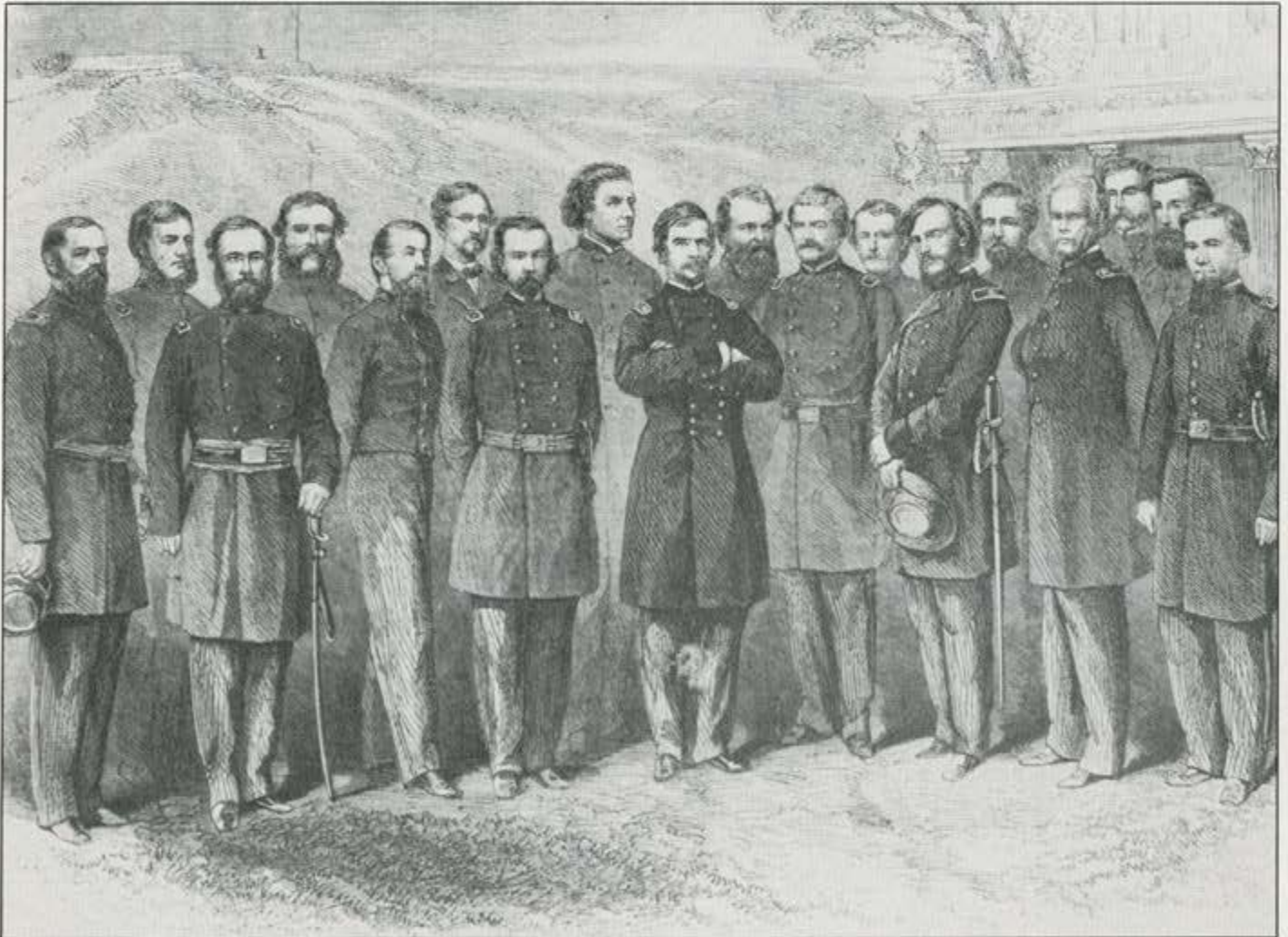
From the Louis A. Warren Lincoln Library and Museum