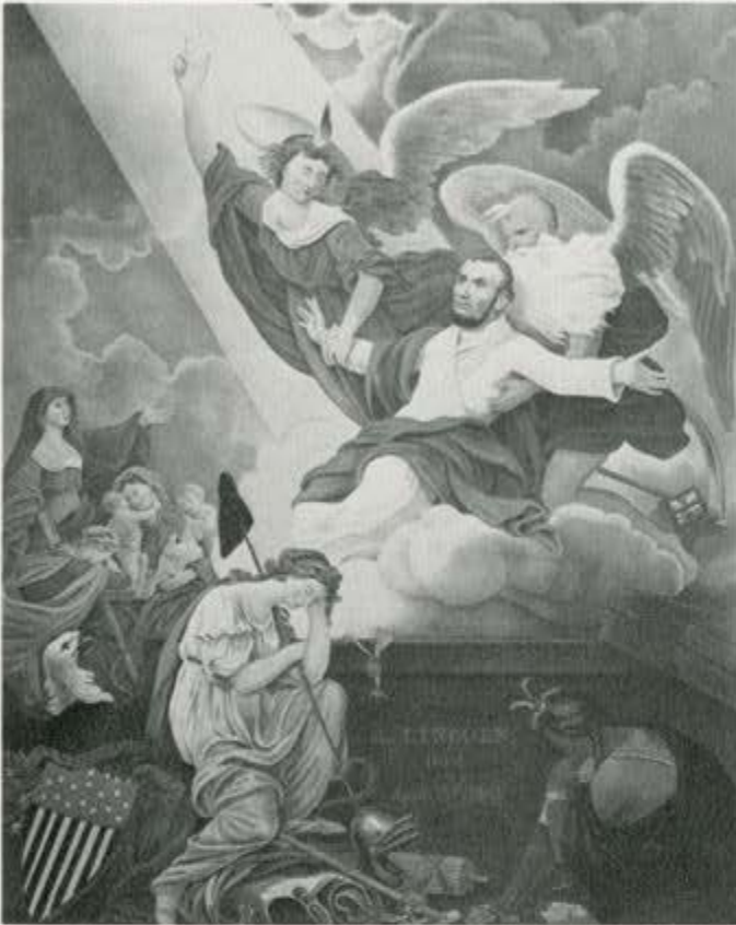
From the Louis A. Warren Lincoln Library and Museum