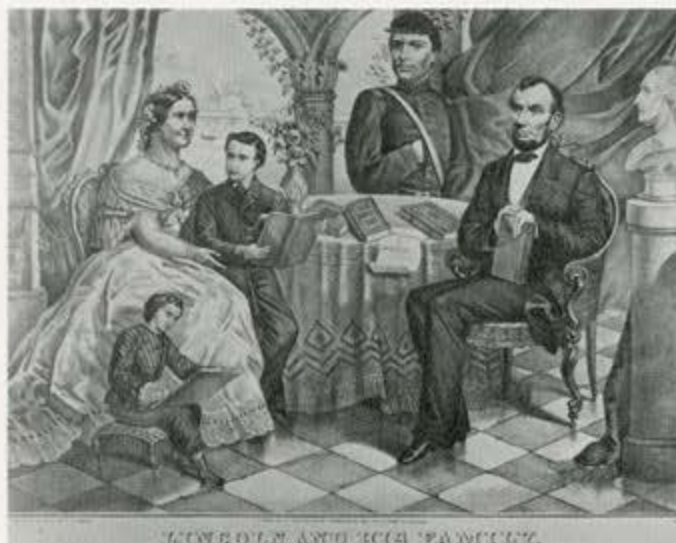
From the Louis A. Warren Lincoln Library and Museum.