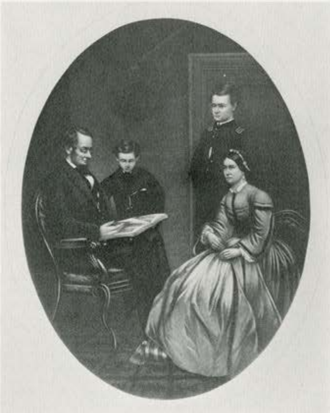
From the Louis A. Warren Lincoln Library and Museum