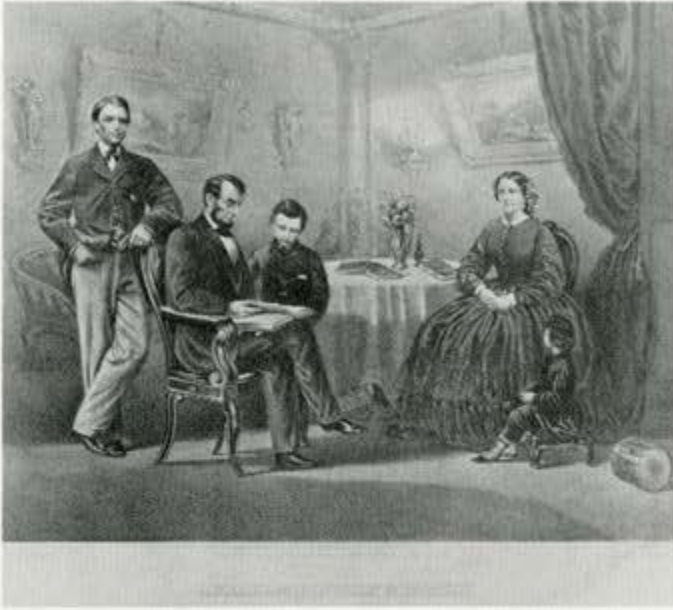
From the Louis A. Warren Lincoln Library and Museum