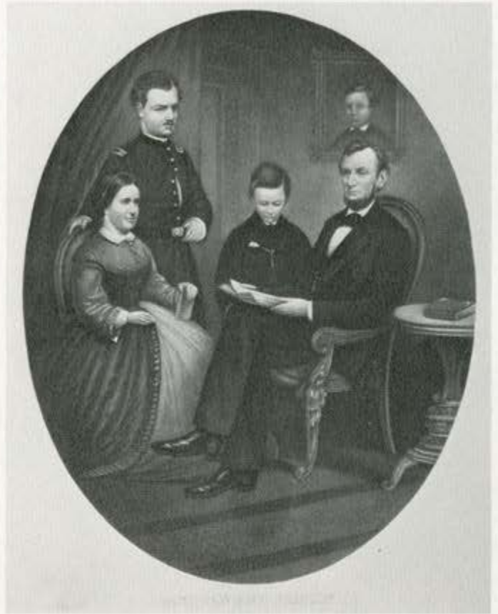
From the Louis A. Warren Lincoln Library and Museum