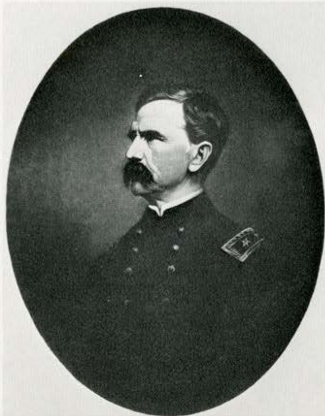
From the Louis A. Warren Lincoln Library and Museum