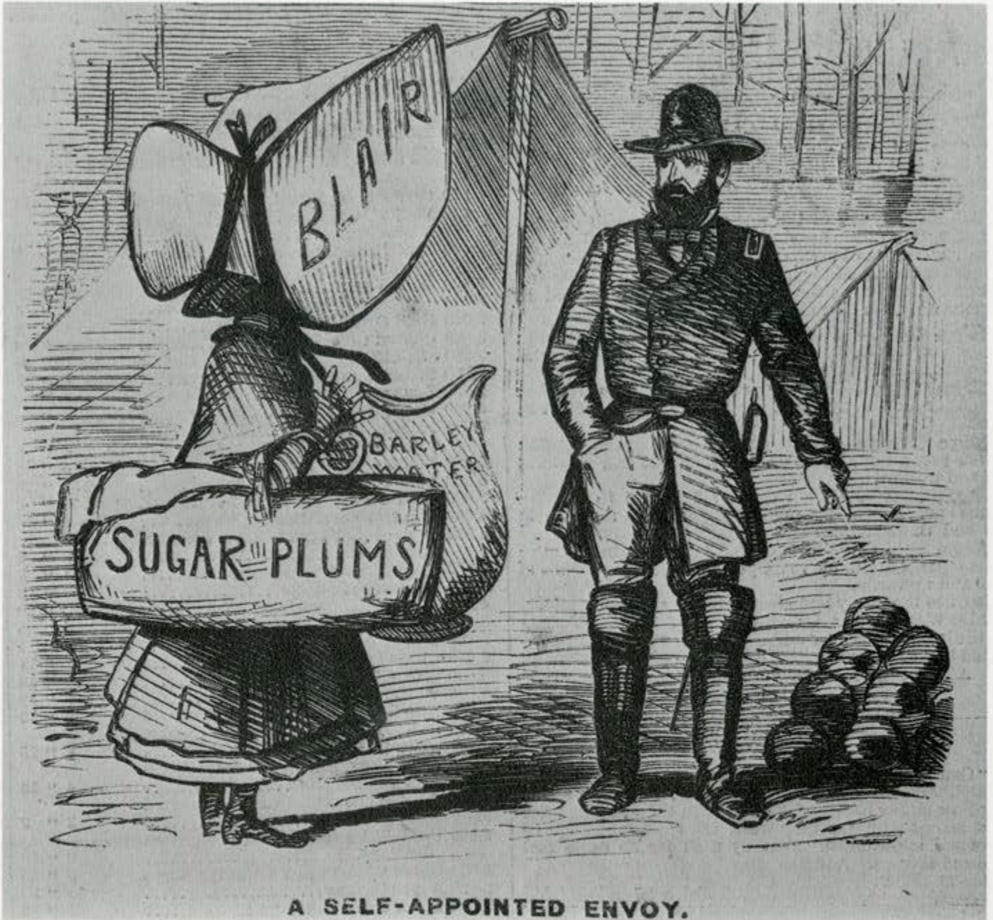
A SELF-APPOINTED ENVOY.