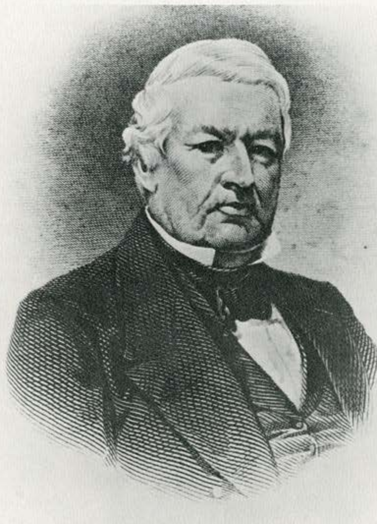
From the Louis A. Warren Lincoln Library and Museum

Among the five living ex-Presidents, none was more hostile to President Lincoln than Franklin Pierce. In 1860, he hoped