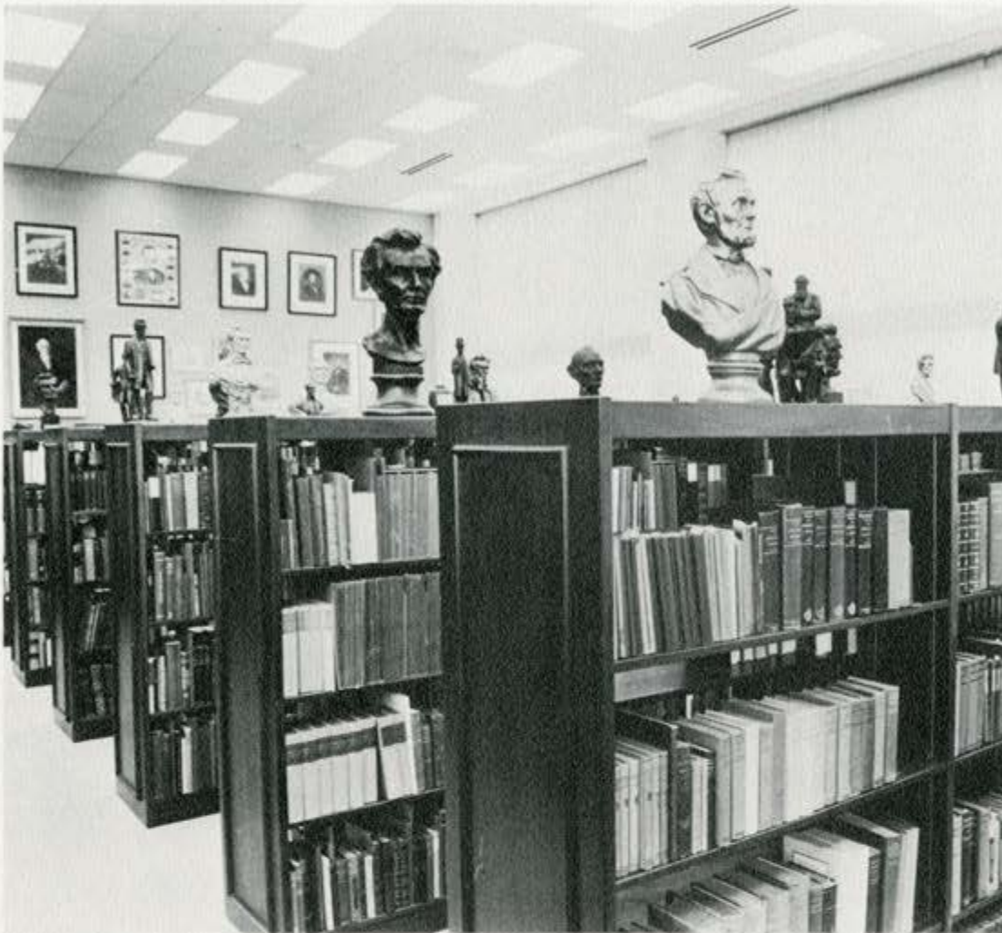
FIGURE 6. The library.