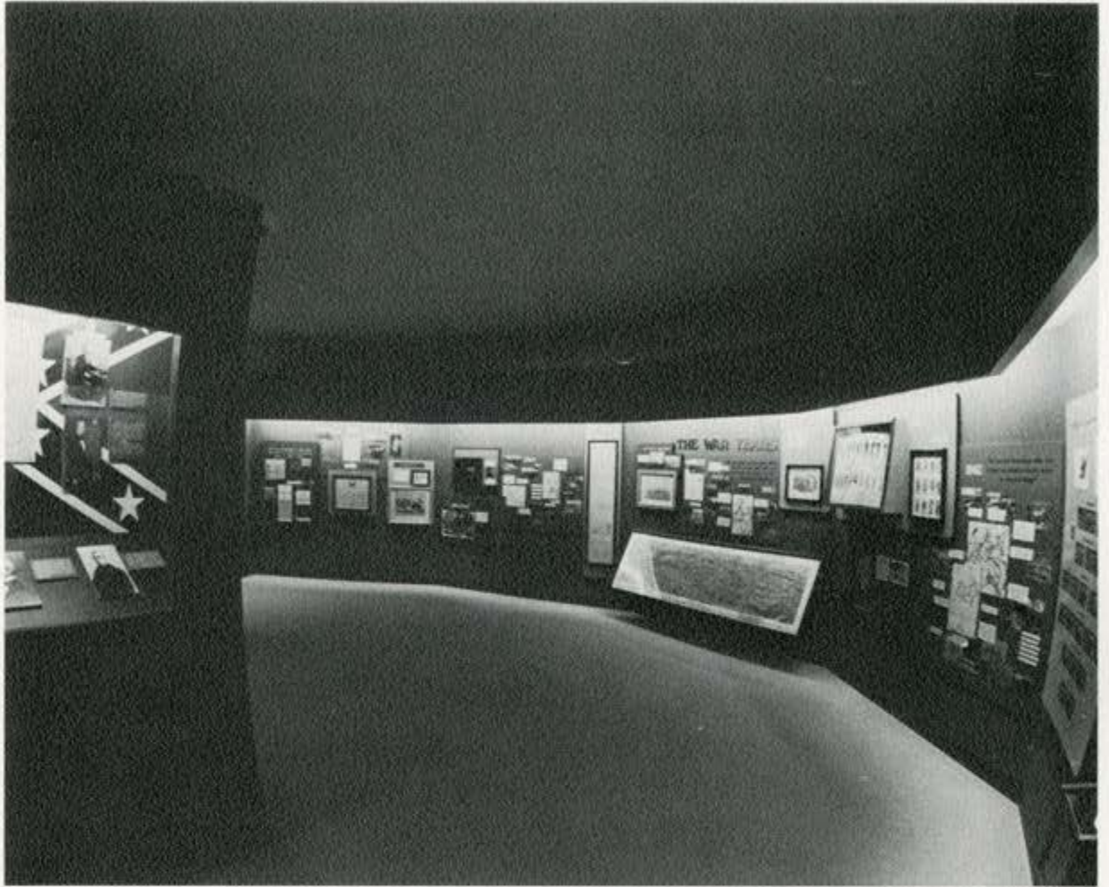
FIGURE 4. Exhibits: The War Years.