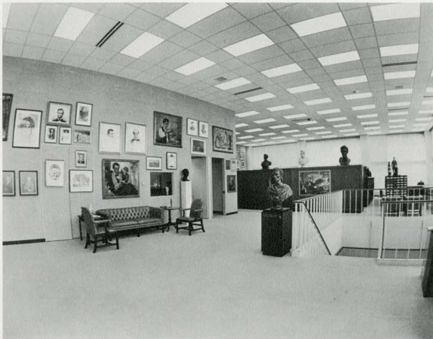
From the Louis A. Warren Lincoln Library and Museum