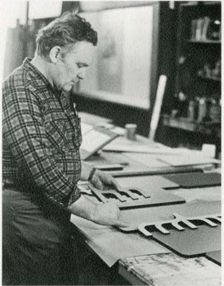
From the Louis A. Warren Lincoln Library and Museum