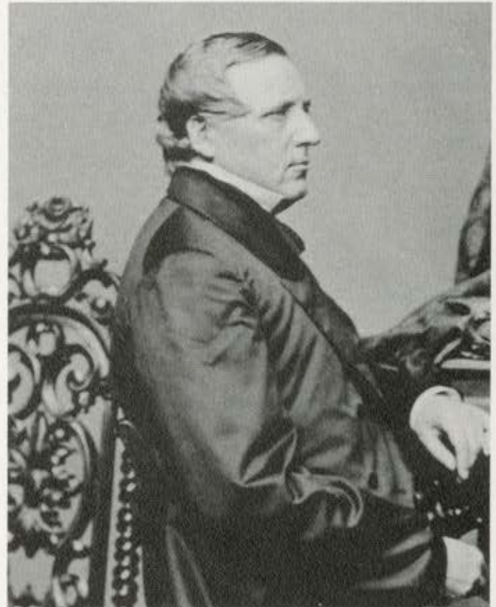
FIGURE 4. John P. Usher