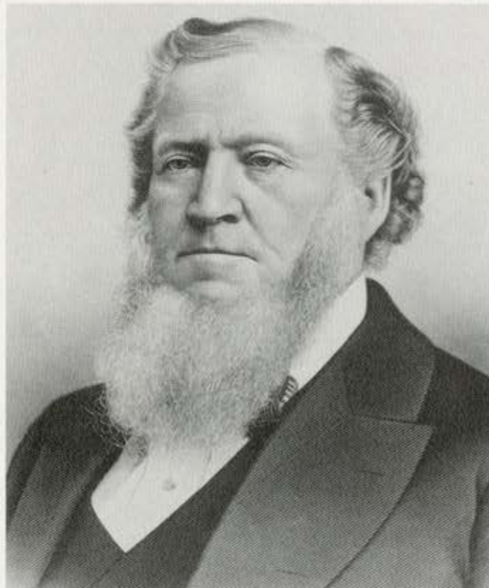
From the Lincoln National Life Foundation