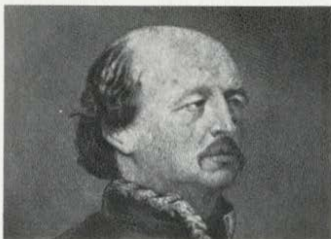
From the Lincoln National Life Foundation

"To do these things required much money," Butler pointed out needlessly. "The poor had to be fed, the streets had to be cleaned, the protection from yellow fever had to be made sure, and able-bodied, idle men had to have employment to keep them from mischief and maintain their families. There was power enough to do all this, but in what manner could it be paid?" He also had to find funds to support the Charity Hospital and other hospitals in the city.