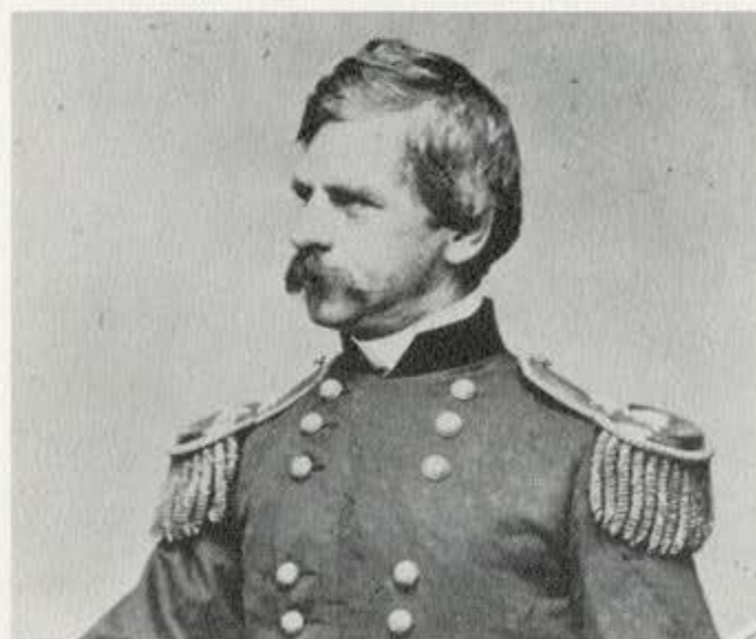
From the Lincoln National Life Foundation