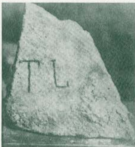
From The Herald Post , Louisville, Kentucky