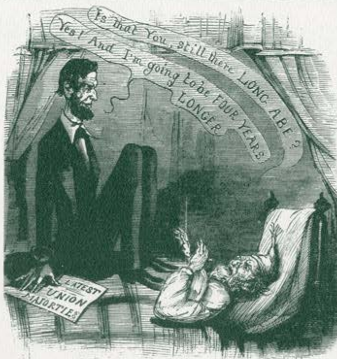
JEFF DAVIS'S NOVEMBER NIGHTMARE.

From Frank Leslie's Illustrated Newspaper , December 3, 1864.