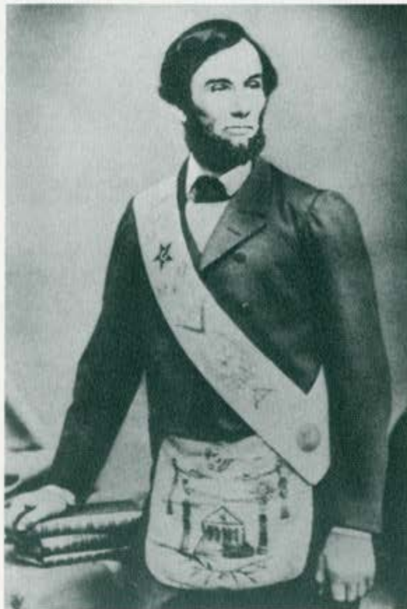
From the Library and Museum of the Grand Lodge F.&A.M., State of New York, 71 West 23rd Street, New York, N. Y. 10010