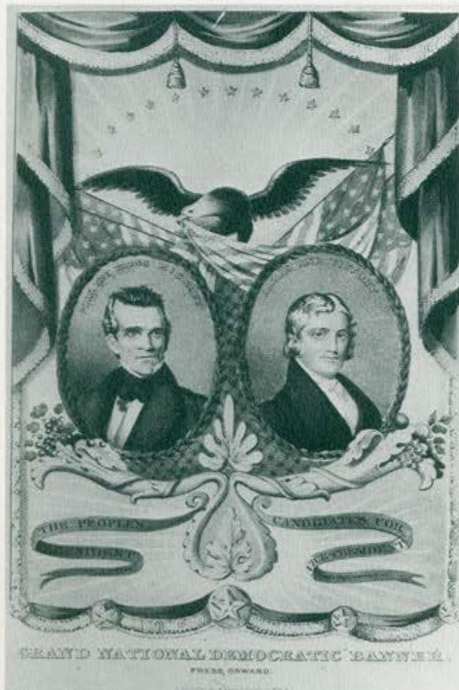
From the Lincoln National Life Foundation

Today one rarely meets more avid collectors than those whose quest is the ephemeral political emblems of all our Presidential campaigns and even the off-year congressional elections. Collectable items include tokens, medals, ribbons, pins, badges, election tickets, buttons, flags and parade paraphernalia. However, it appears that only the more advanced collectors of political ephemera seek lithographs and broadsides. Perhaps the political prints published by Currier & Ives, Kellogg, Magnus and others became collectors' items long before the cheaper paper, cloth and metal emblems of politics; however, it was only about twenty-five years ago that