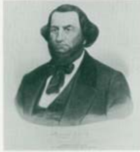
Herschel V. Johnson

There is no record that Lincoln voted in this election of November 7, 1864.