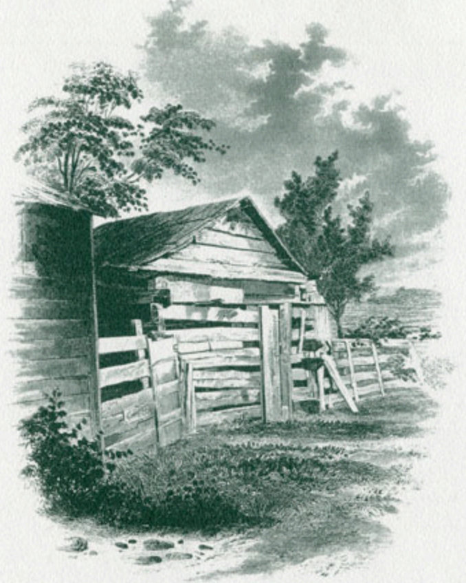
A J. C. Buttre engraving of the so-called early Elizabethtown, Kentucky, home of Abraham Lincoln, published in New York City in 1860. A caption erroneously states that "His father built this cabin and moved into it when Abraham was an infant, and resided there till he was Seven Years of age, when he removed to Indiana." This engraving may have been made from a photograph taken by S. Alschuler of Chicago.