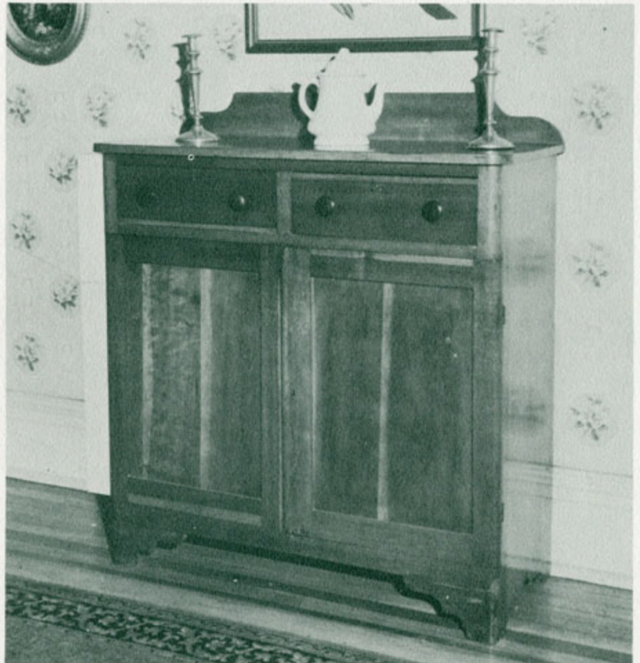
From the Lincoln National Life Foundation

The following pieces of Lincoln furniture, exclusive of cupboards, are known to be extant and are listed here as examples of Thomas Lincoln's handiwork: