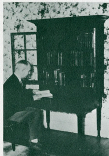
From the Lincoln National Life Foundation

"During its lifetime the desk has been used as a book case for law books, as a cabinet to store the powders and equipment of a druggist, in