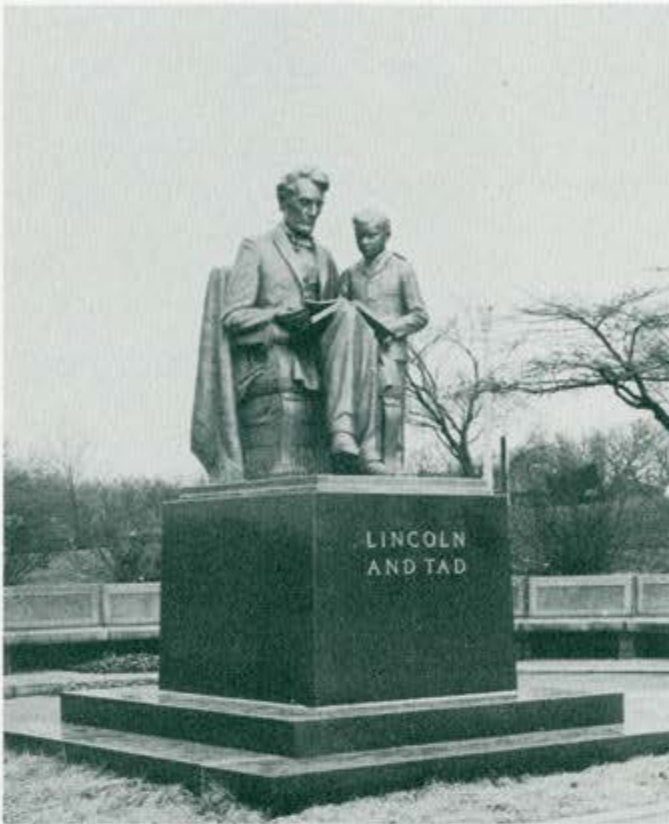
From the Lincoln National Life Foundation