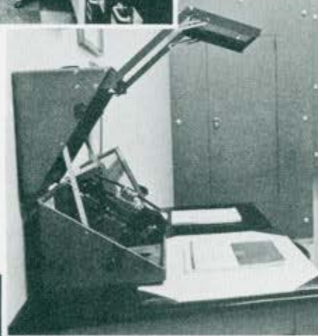
(At right) Microfilm reading room adjacent to Lincoln Library.