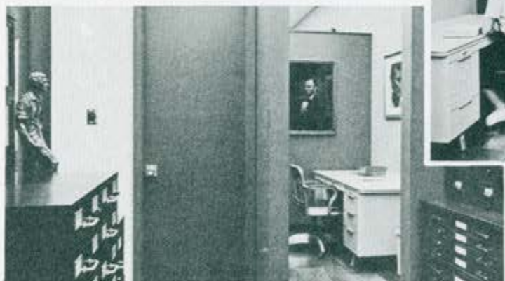
A private study room for Lincoln students who wish to do research in the Foundation Collection.