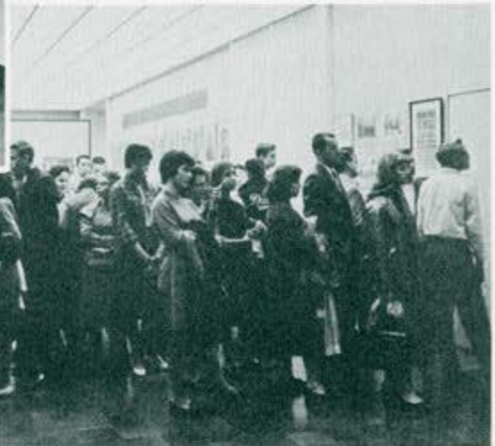
The art classes of the Dunkirk High School of Dunkirk, Indiana, visit the Lincoln museum.