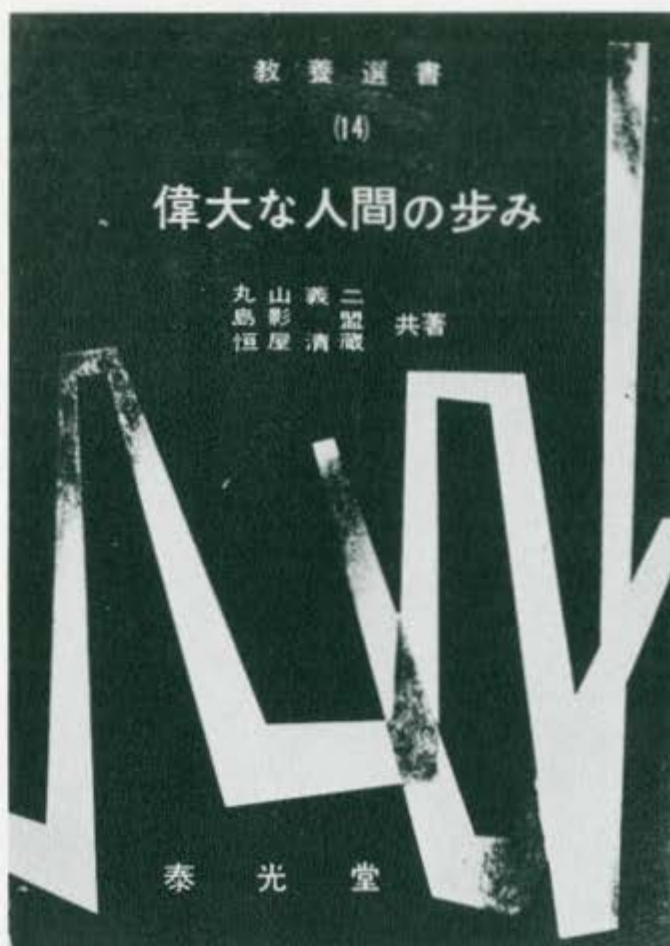
Plate No. 4 Japanese 1959-159

(Translation): The Great Emancipator Abraham Lin-