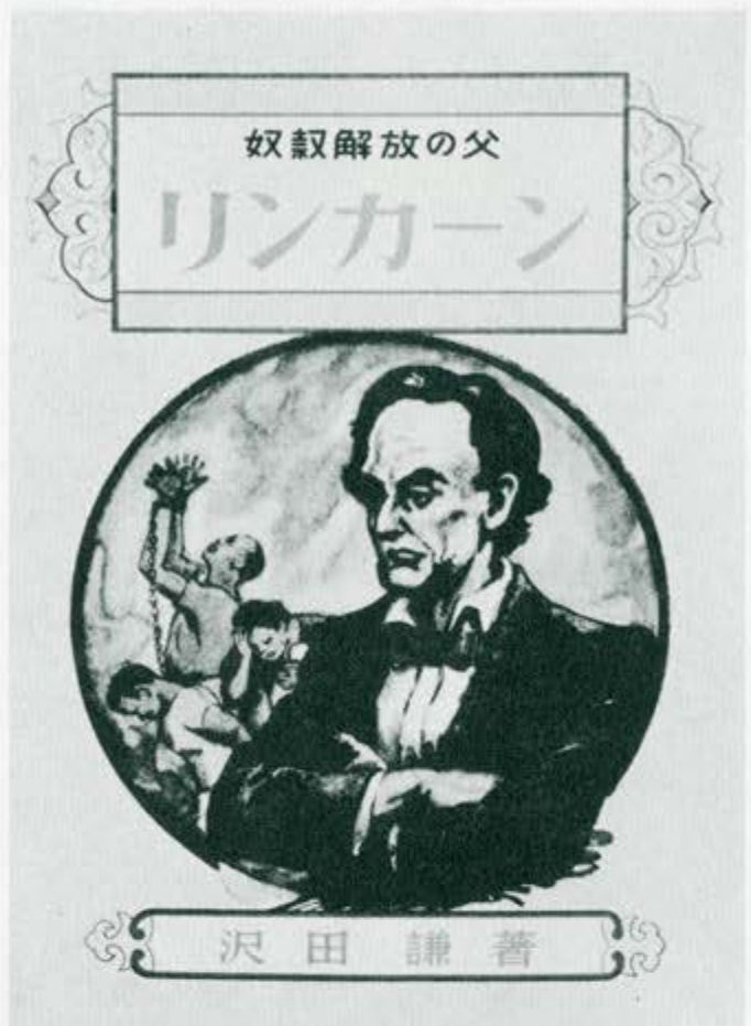
Plate No. 2 Japanese 1959-157

(Translation): Abraham Lincoln/Adapted from the original Doubleday and Company edition, which was