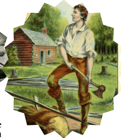
Lincoln wields his mighty ax